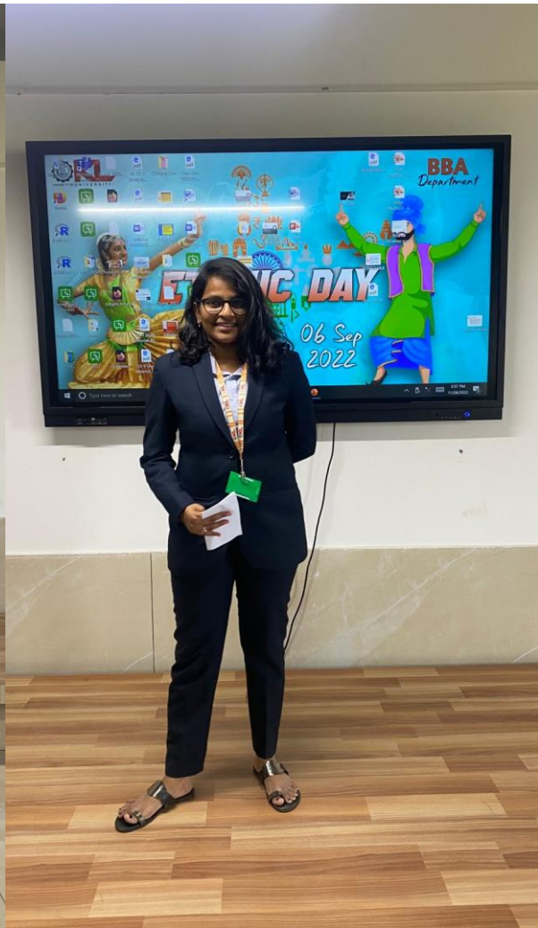
Picks of professional society activity “The Journey of Business Model” on 28 th November 2022