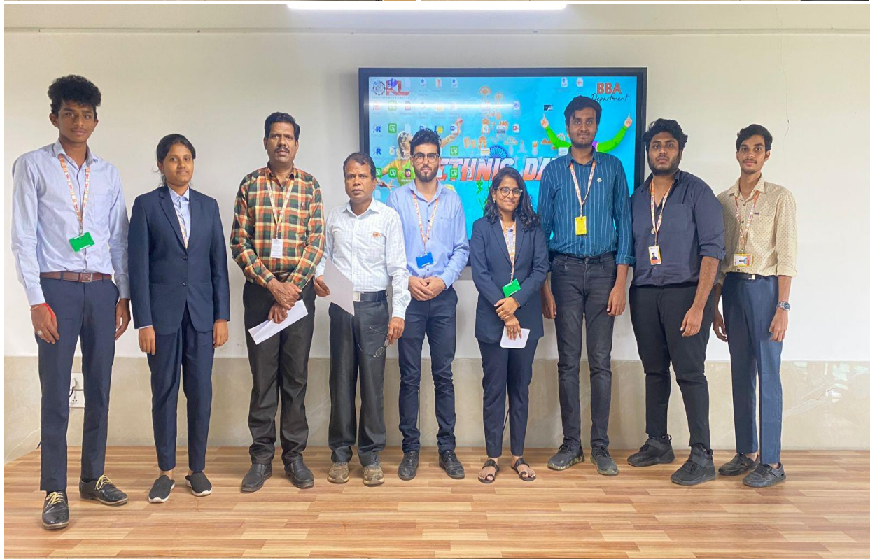
Picks of professional society activity “The Journey of Business Model” on 28 th November 2022